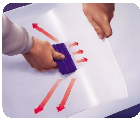
Easy to install

FluoroGrip® fluoropolymer appliqués provide excellent surface protection for a wide variety of uses in aerospace, military and transportation applications. The appliqués offer a superior paint replacement alternative for demanding requirements, delivering excellent chemical resistance, very high tensile strength and flexural modulus.