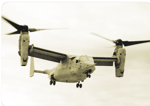
Lightning strike protection

FluoroGrip multifunctional appliqués protect military aircraft and equipment including leading edges of the fuselage, wing flaps and other structures, as well as decals and identification markers.