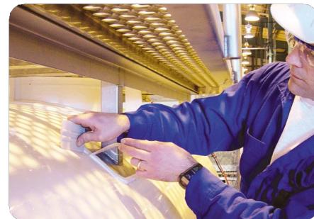
Application on tanker truck