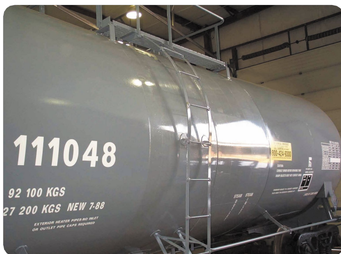
Splash zone protection