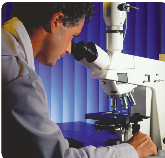
Research and design in conjunction with leading universities and government agencies.

For more information on FluoroGrip Fluoropolymer surface protection and paint replacement appliques, call Integument Technologies, Inc. today or visit us on the web at www.integument.com .